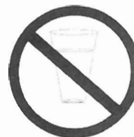
FIGURE 601 INTERNATIONAL SYMBOL

Except as required in Section 601.3.3, nonpotable water systems shall have a yellow background with black uppercase lettering, with the words “CAUTION: NONPOTABLE WATER, DO NOT DRINK.” Each nonpotable system shall be identified to designate the liquid being conveyed, and the direction of normal flow shall be clearly shown. The minimum size of the letters and length of the color field shall comply with Table 601.3.2. [HCD 1 & HCD 2] An international symbol of a glass in a circle with a slash through it shall be provided similar to that shown in Figure 601 for all nonpotable water systems.